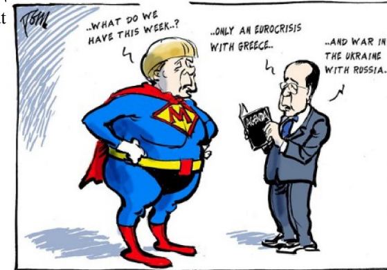
Fig. 1 Personal individual cartoon

of categories, their quantitative analysis was carried out. We analyzed the number of cartoons and the distribution of cartoons with and without text (caption) in each content-related category (table 1 in chapter Research findings ). We : s in each content-relat