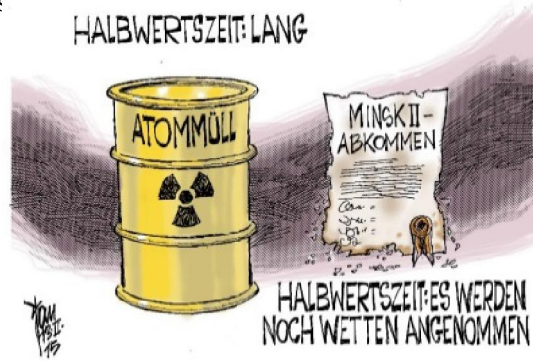
Fig.3 Impersonal cartoon

techniques enhance the ironic or sarcastic effect of the political cartoon: a) the caption or replica of characters contrast sharply with the situation depicted in the cartoons; b) allusions with films, computer games, characters of fairy tales, historical events and characters. c) wordplay. d) homophony. Some results of the analysis: