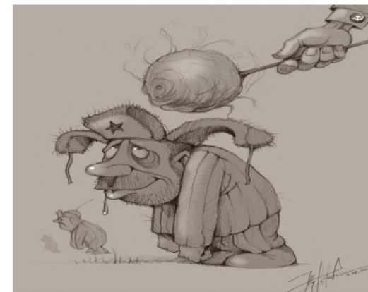
Fig. 2 Personal group cartoon

The next stage of the study was the analysis of verbal and non-verbal means used in political cartoon to enhance its ironic or sarcastic effect. This feature is one of the most important in the political cartoon. Thus, following